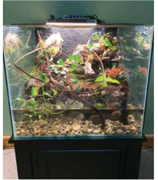
New frog habitat tanks recently built by our Zoo staff