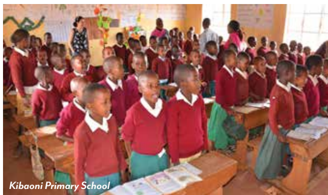
Kibaoni Primary School

punctuates this thrilling full day of game tracking. Later, survey the crater and abundant wildlife from your lodge's viewing terrace, right on the crater's rim. (B,L,D)