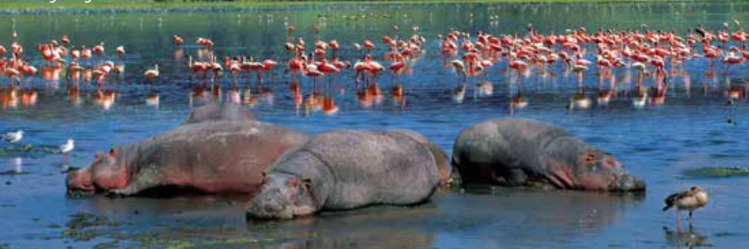
Hippopotamus and flamingos in Ngorongoro Crater