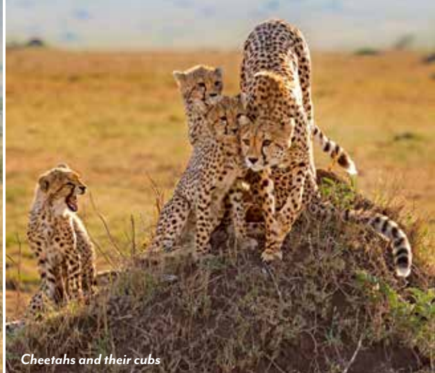
Cheetahs and their cubs