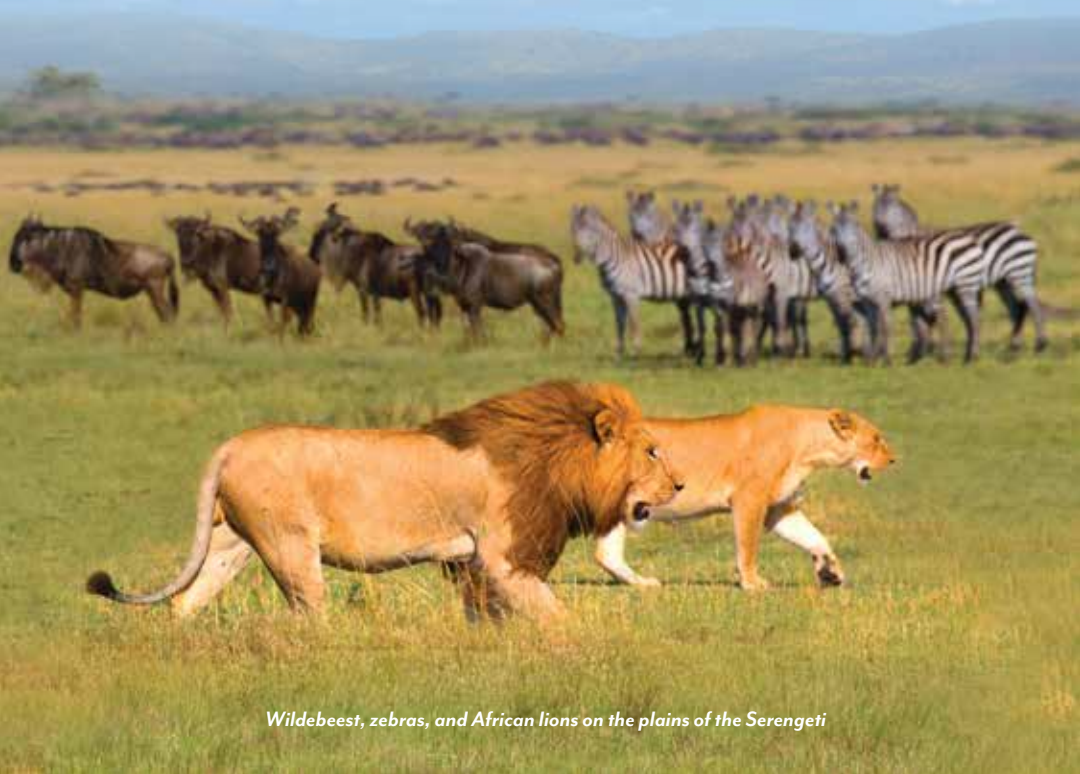
Wildebeest, zebras, and African lions on the plains of the Serengeti

When not on safari, visit a coffee plantation in Arusha, a Maasai village near Lake Manyara, a primary school on the edge of the Rift Valley, and Olduvai Gorge—a precious paleontological site often referred to as the “Cradle of Mankind.”