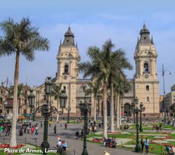
Plaza de Armas, Lima