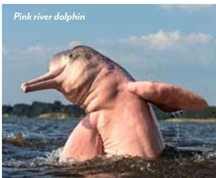
Pink river dolphin