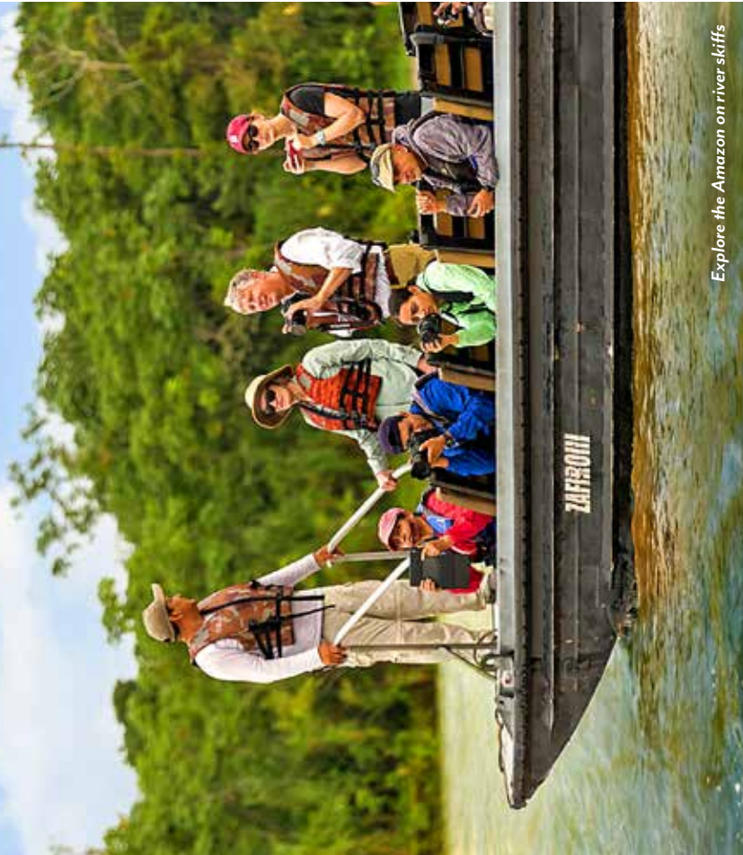
Explore the Amazon on river skiffs

PRSRRT STD U.S. Postage PAID Gohagan & Company