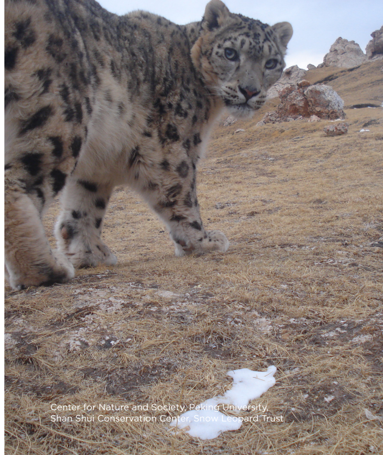
Center for Nature and Society, Peking University, Shan Shui Conservation Center, Snow Leopard Trust

Contributions also include species-specific funding donated to partner organizations working with species included in the Zoo's collection. Partners include the International Elephant Foundation, Lion Landscapes, SANCCOB, Giraffe Conservation Foundation, Polar Bears International, Panamanian golden frog, Red Panda Network, and Snow Leopard Trust.