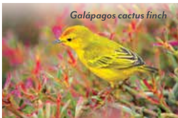
Galápagos cactus finch