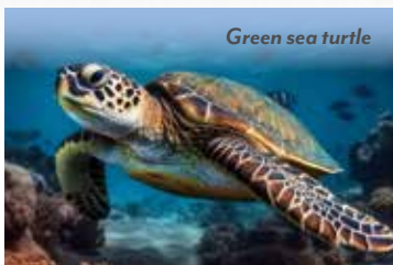
Green sea turtle

An astonishing vision of life without humans, the Galápagos Islands represent a truly unique environment. Located six hundred miles off the coast of Ecuador, the archipelago's isolation, combined with the nutrient-rich waters of the Humboldt Current, have created one of the world's richest marine ecosystems. Darwin's "living laboratory," the Galápagos Islands spurred the naturalist's paradigm-shifting work, On the Origin of the Species . Published in 1859, his speculations on natural selection in the role of "aboriginal creations, found nowhere else," inspired one of the most revolutionary scientific theories in history. One of the first and most treasured UNESCO World Heritage Sites, the Galápagos sustains an astounding number of endemic species, which continue to thrive with the absence of natural predators.