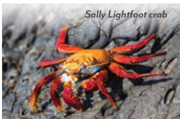
Sally Lightfoot crab