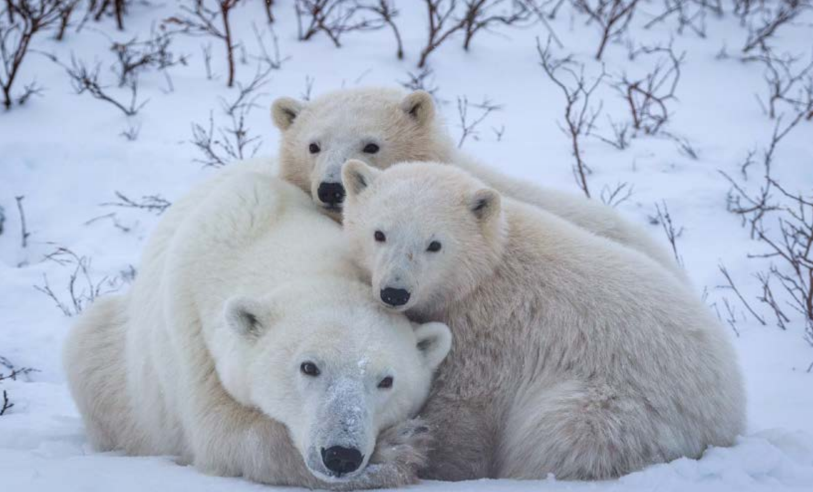
Polar Bear International - Dmytro Cherkasov