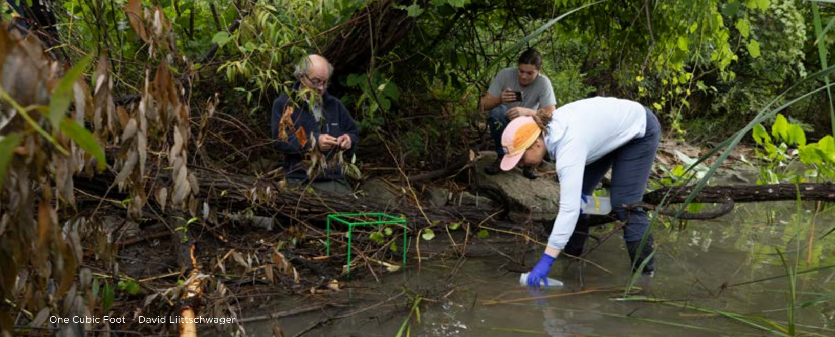
One Cubic Foot

the Zoo's success - is ensuring that every experience with the Zoo is engaging and designed to inspire conservation action and build greater involvement with the Zoo. In other words: when you come to the Zoo, or see the ZooMobile out at a library, or assist at a Community Cleanup, we want you to leave that encounter thinking: When can I go back to the Zoo? What can I do to be more involved with the Zoo? How can I take what I learned and share it, and be a better environmental steward?