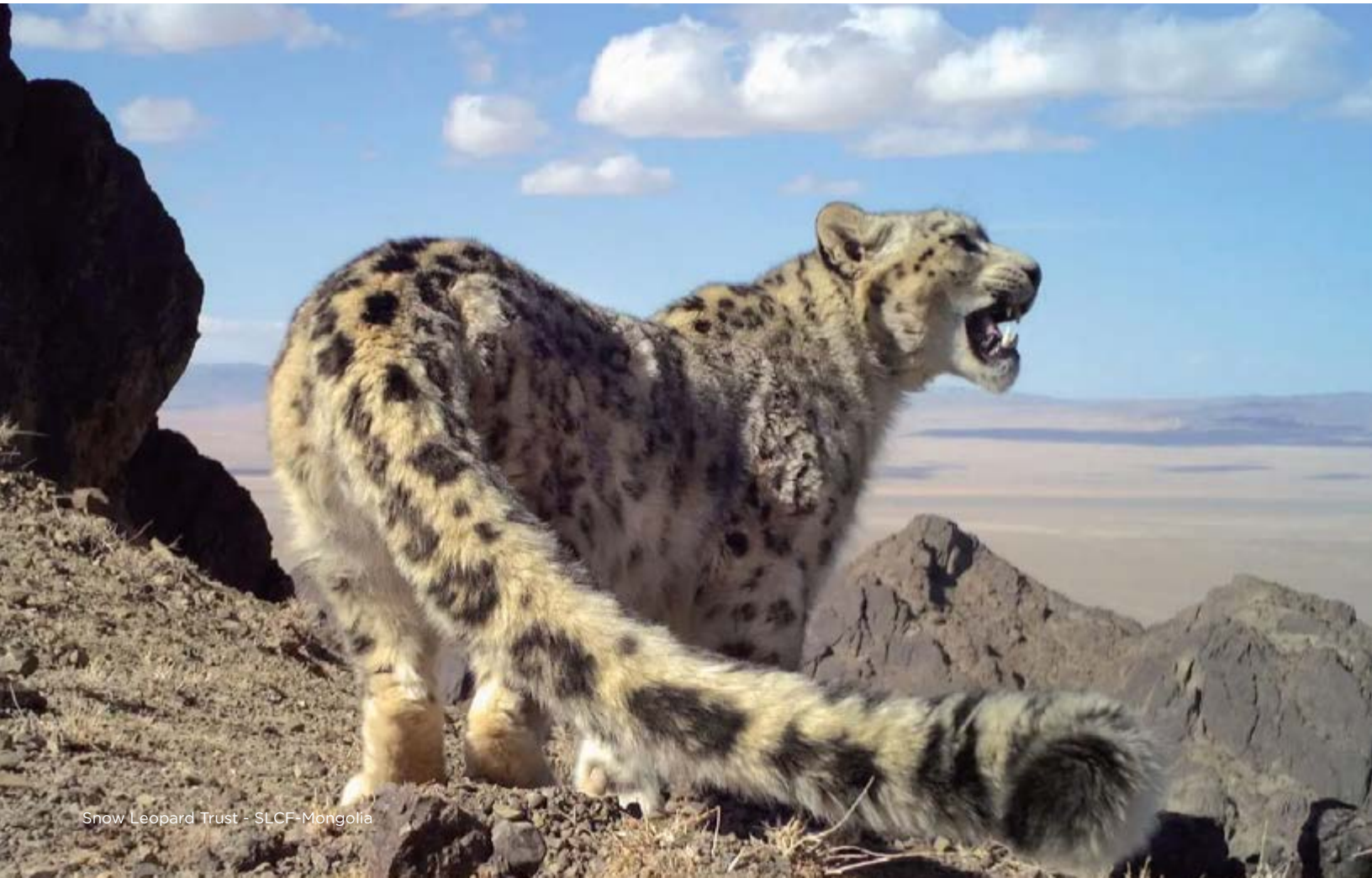
Snow Leopard Trust - SLCF-Mongolia