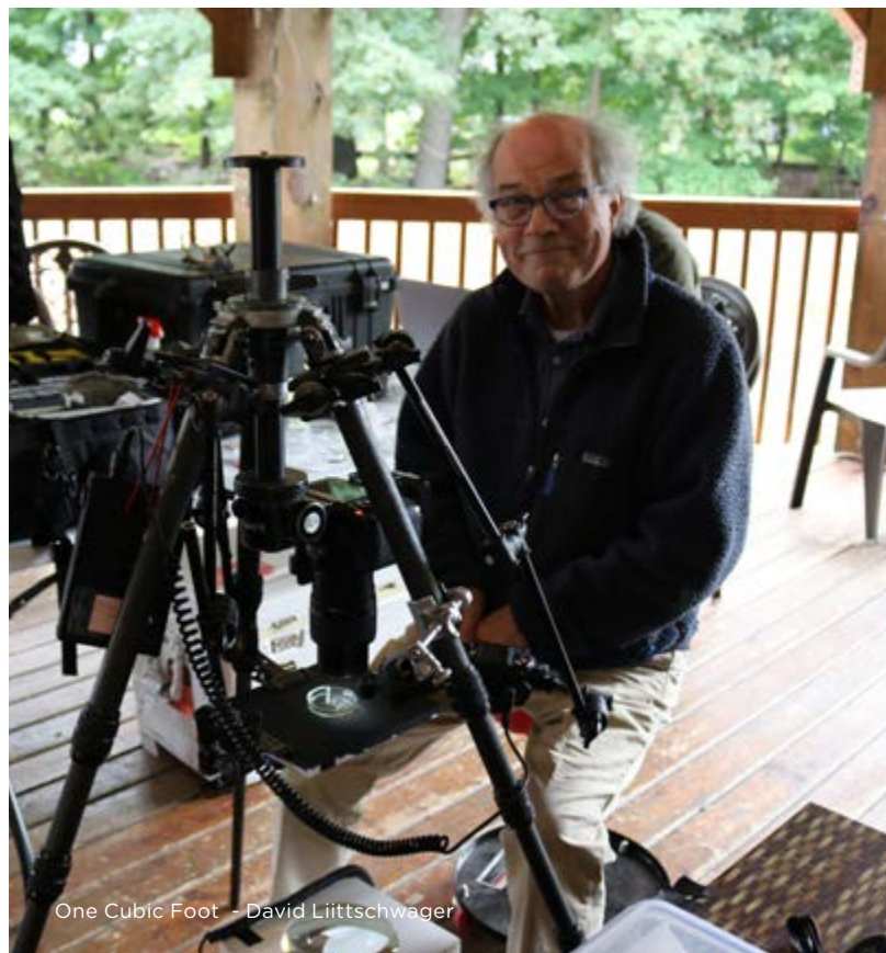
One Cubic Foot - David Liittschwager